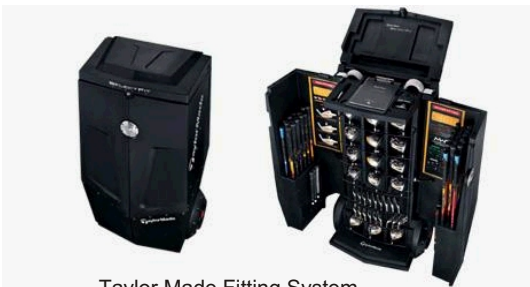
Taylor Made Fitting System

All major golf manufactures available including: Callaway, Cobra, Titleist, Ping & Taylor Made